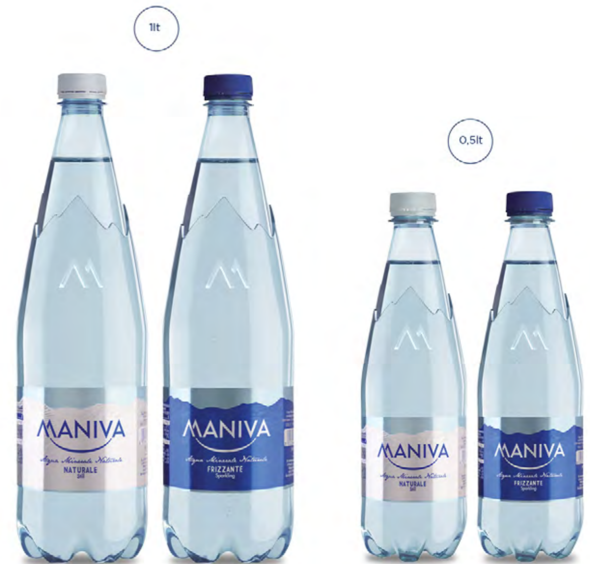
SPARKLING AND LIGHTLY SPARKLING WATER