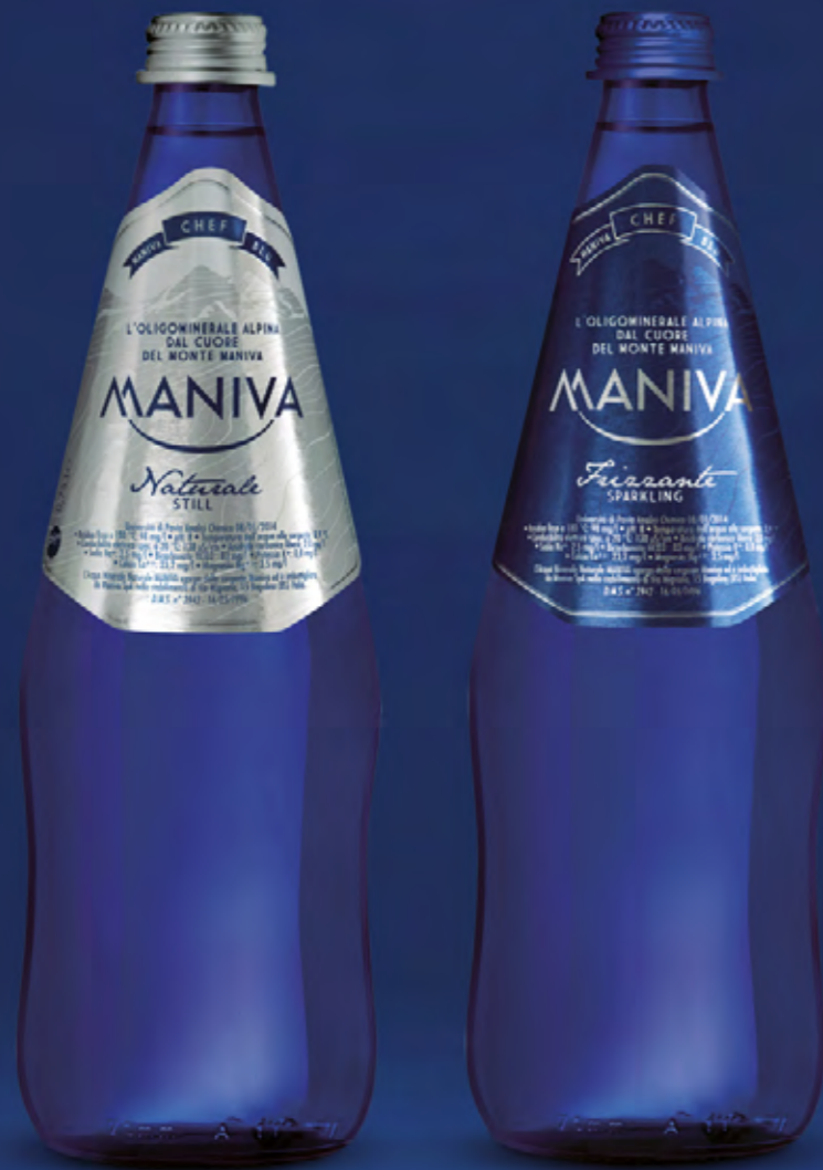
NATURAL AND SPARKLING WATER