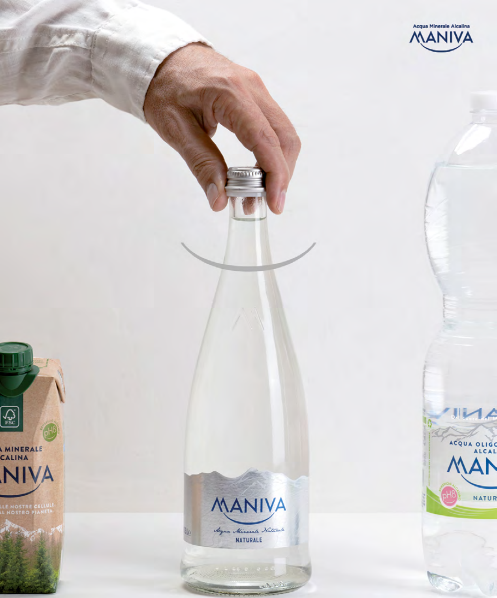
MINERAL WATER FROM MOUNT MANIVA