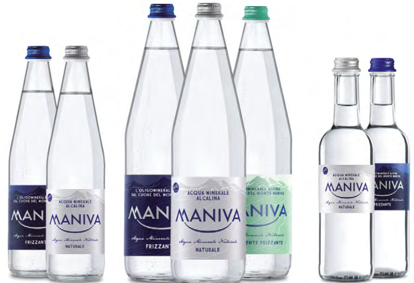
NATURAL, SPARKLING AND LIGHTLY SPARKLING WATER